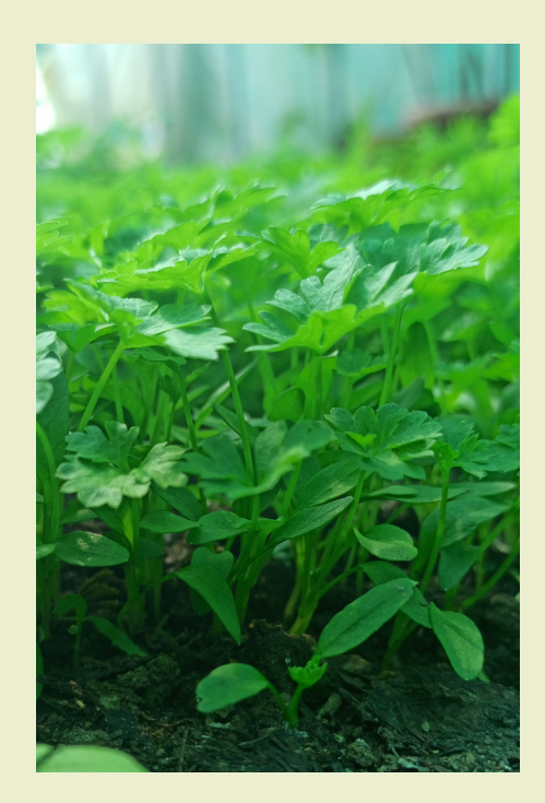
Figure 3: Parsley, MAP, Yusipang