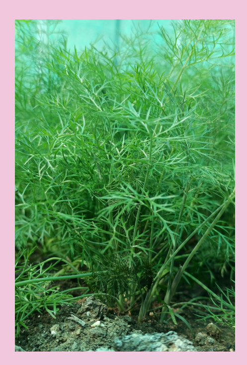
Figure 5: Dill, MAP, Yusipang