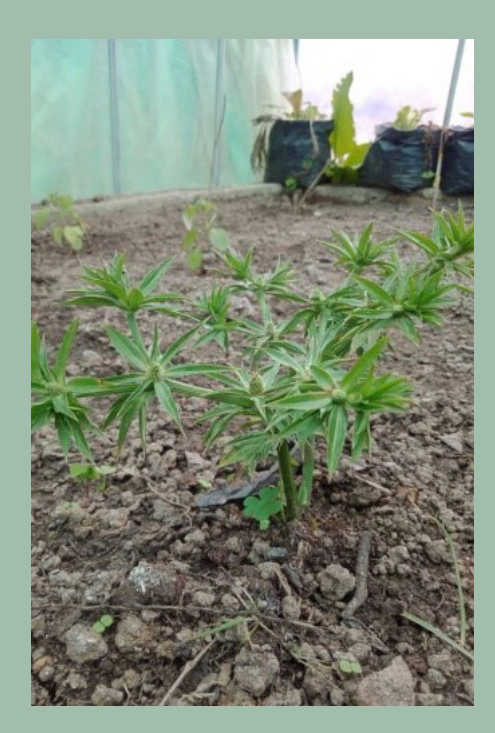
Figure 8: Culantro, MAP, Yusipang