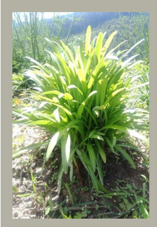
Figure 12: Chives, MAP, Yusipang