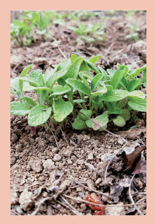
Figure 15: Sage at Ganey geog, 2020