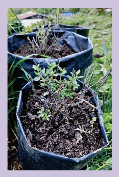
Figure 6: Thyme, MAP, Yusipang