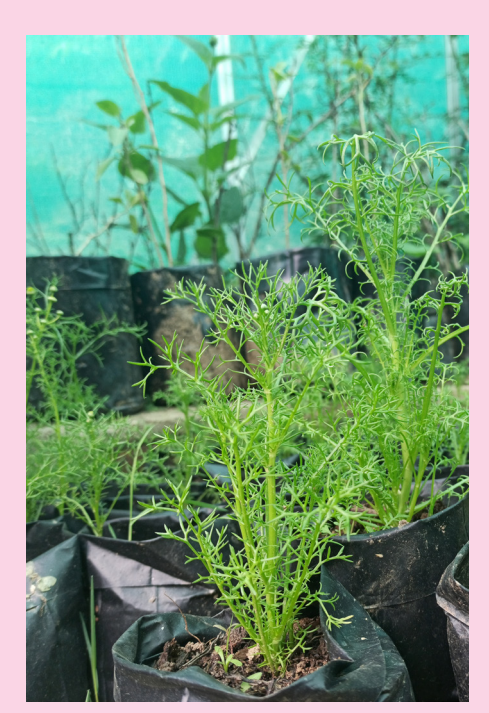
Figure 11: Chamomile, MAP, Yusipang