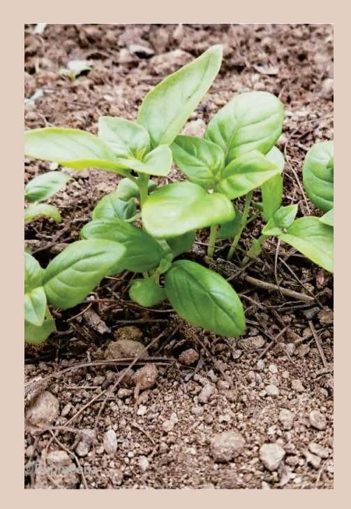
Figure 4: Basil at Ganey, 2020