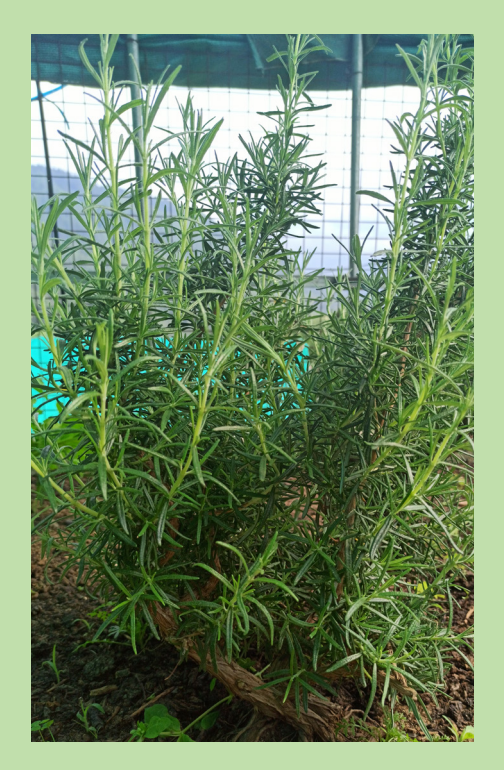
Figure 1: Rosemary, MAP, Yusipang