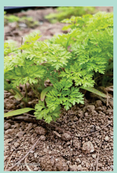
Figure 14: Chervil at Ganey geog, 2020