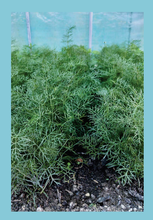
Figure 9: Fennel, MAP, Yusipang