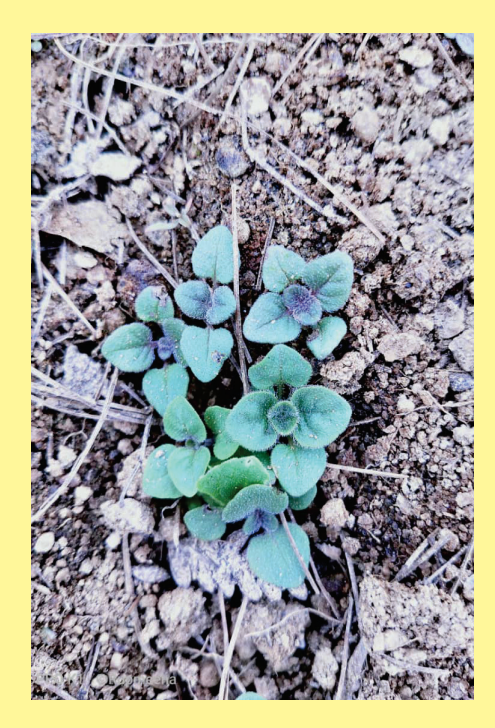
Figure 13: Oregano at Ganey, 2020