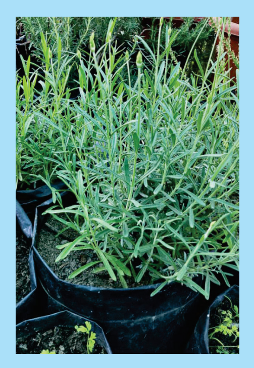
Figure 2: Lavender, MAP, Yusipang