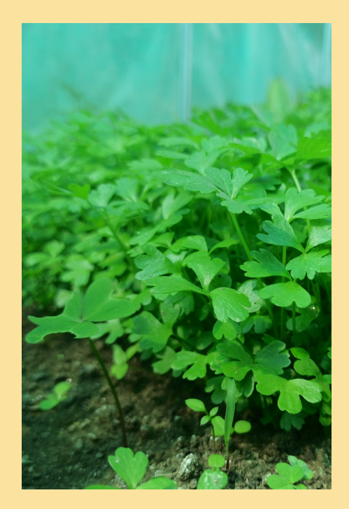
Figure 10: Celery, MAP, Yusipang