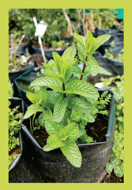
Figure 7: Mint, MAP, Yusipang